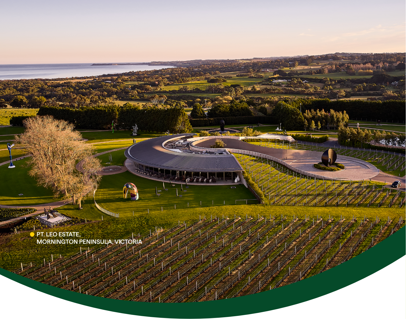
● PT. LEO ESTATE, MORNINGTON PENINSULA, VICTORIA